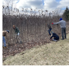
Improve Our World