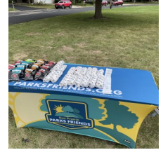
Be a Park Friend