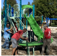
Improve Our Parks